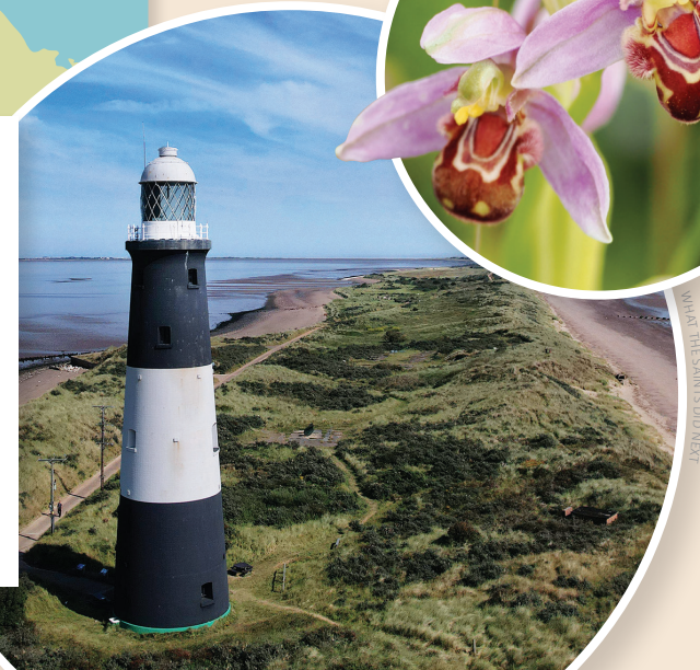
WIMPIE THE SAINTS DID NEXT