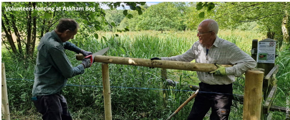
Volunteers fencing at Askham Bog