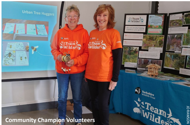
Community Champion Volunteers

Join our wildflower expert for a fascinating day of learning. The first half will be a presentation