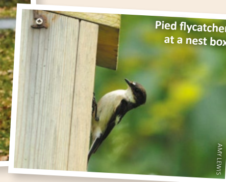
Pied flycatcher at a nest box