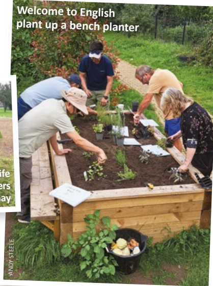
Welcome to English plant up a bench planter